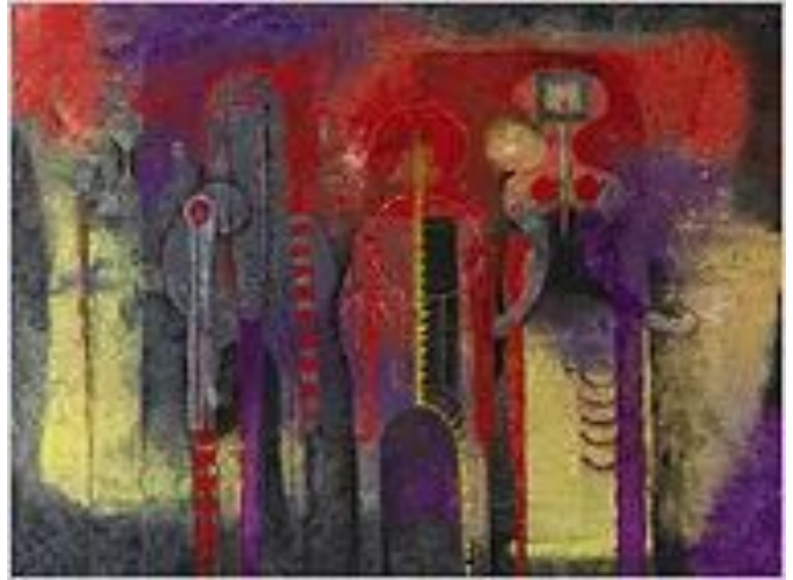
Tres Personajes, 1970